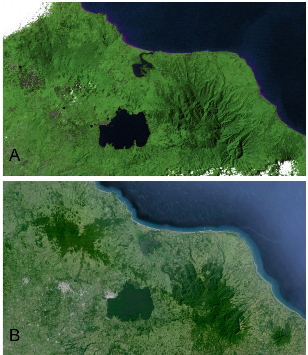
Figure 1 Comparative views of the Sierra de Los Tuxtlas from an artificially colorized 1979 Landsat image (A) and a 2010/11 Google Earth image (B) showing the extent of deforestation in the region. Remaining forest has become concentrated at higher elevations on the slopes of the region's three volcanoes, San Martín, Santa Marta, and San Martín Pajápan (the forested areas remaining, from left to right).

Dirzo & Vogt, 1997 ). Over the following decades this site became largely isolated from other tracts of forest, although a corridor of forest remains, connecting to the more extensive upland forests on Volcán San Martín ( Dirzo & Garcia, 1992; Fig. 2 ). The first intensive sampling of birds in the region began in 1973, and data from that effort are included here (see Winker, 1997 ).